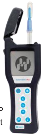
SystemSure™ ATP monitoring instrument

Once the surfaces have been identified, they will be tested using an ATP surface test to determine the contamination level and establish a baseline.